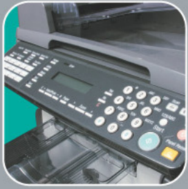
Fax-copy control panel with easy-to-use fax/scan/copy buttons and LCD screen