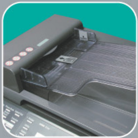
50-sheet automatic document feeder for fast and easy copying and scanning jobs